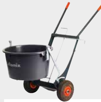
Additional accessory: Transport trolley