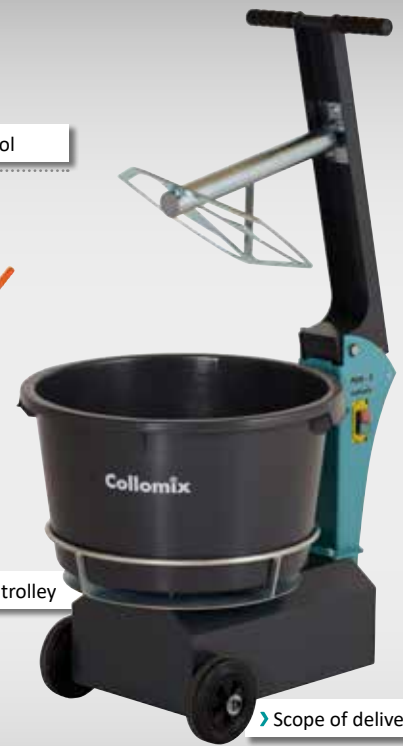
Scope of delivery