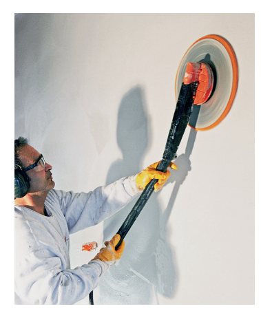
Relaxed machining due to low machine weight