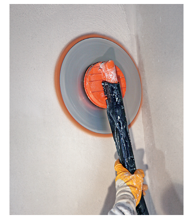
Smoothing up to the edges