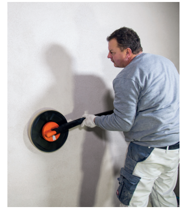
New engine technology: Lower rotation speed possible → for a perfect surface structure

Premium package "Gypsum multi finish" Unit No. Fig. Sponge on plastic board, trowel, supporting Set 34305 – plate and polishing pad (without picture)