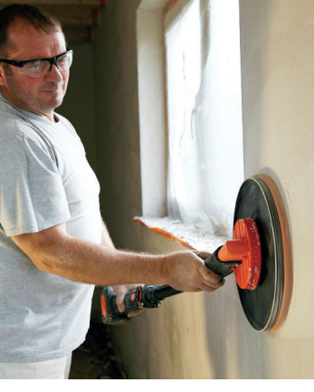
Relaxed machining on large wall surfaces

additionally compatible with cordless power tools from other well-known machine manufacturers. Further informations on www.cordless-alliance-system.com.