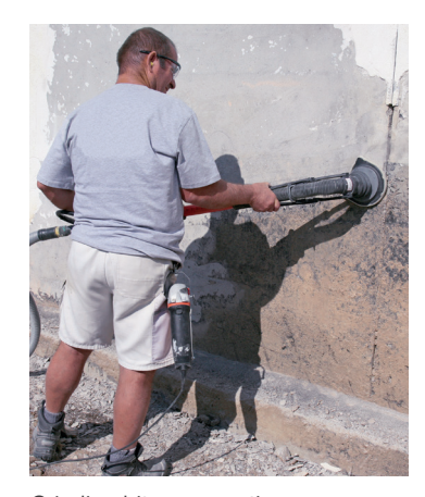
Grinding bitumen coating with PCD grinding disc