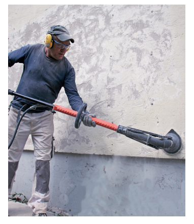
Removing old plaster and paints